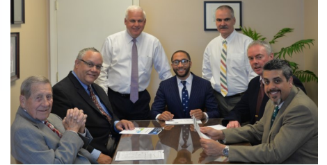
The Research Committee

Contribution checks to your Pershing accounts need to be made payable to PERSHING LLC . Cadaret Grant can no longer accept checks payable to them.